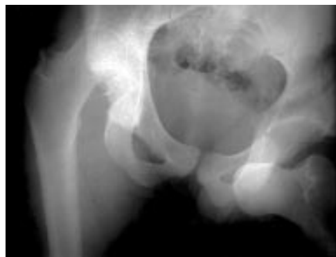
Figure 1 Radiograph of the pelvis and both hip joints showing an anterior dislocation of the left hip and a posterior dislocation of the right hip.

Both hips were reduced within one hour of presentation by closed manipulation under general anaesthesia. A radiograph after reduction confirmed concentric reduction and excluded any intra-articular fragments (fig 2). He was kept on bed rest for three weeks with skeletal traction followed by a further six weeks of non-weightbearing.