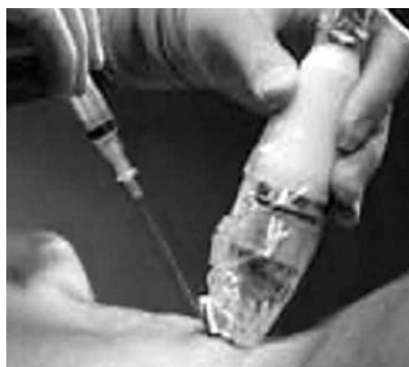
Figure 2 Ultrasound transducer with needleguide (courtesy of Dymax Corp).

The use of ultrasonography by emergency physicians has increased over the past decade. 9 Ultrasound is used in the ED for detecting free intra-peritoneal fluid in trauma, for confirming the presence of abdominal aortic aneurysms, confirmation of intra-uterine pregnancy, diagnosing renal and gallbladder calculi, and the detection of soft tissue