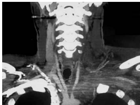
Figure 2 Showing an extensive thrombus within the left jugular vein, which extends to brachiocephalic and left axillary veins.

Spontaneous thrombosis of the axillary or subclavian veins was first postulated as a cause of upper extremity pain and swelling by Sir James Padget in 1875. 1 Von Schroetter demonstrated thrombotic occlusion of upper limb veins, hence the Padget-Schroetter syndrome. More recently, the association between strenuous repetitive movement of the upper extremity and axillosubclavian thrombosis has been recognised and termed effort syndrome. 2 Apart from iatrogenic