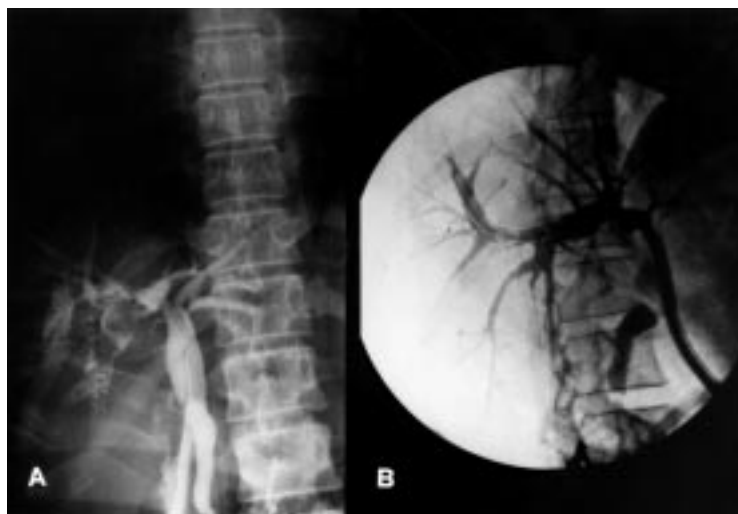
Figure 2 (A) Residual stones with PTCS tube stenting. (B) Complete clearance of stones was achieved and excellent visualisation of the biliary tree was shown by cholangiography.

ERCP and peroral choledochoscopy can be used to manage most patients who present with extrahepatic bile duct stones but this approach may fail in the presence of stones peripheral to intrahepatic strictures. 17 Extracorporeal shock wave lithotripsy is also usually unsuccessful because of the strictures and associated stone impaction. 4 We did not use laser lithotripsy in