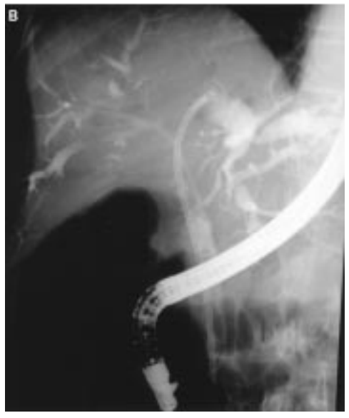
Figure 1 (A) Magnetic resonance cholangiography (MRC) displaying a Bismuth's type II hilar tumour (native axial image). (B) Endoscopic retrograde cholangiography in the same patient, performed 12 hours after MRC, confirms the type II hilar extension and allows selective intubation of both hepatic ducts (see guidevires) and subsequent insertion of two stents (not shown on the figure) for complete biliary drainage.

Magnetic resonance cholangiograms were not of diagnostic quality in two patients, with ascites causing severe image blurring. Intrahepatic bile duct dilatation was present at MRC in 17/18 patients, and common bile duct dilatation was present in 3/18. In 14/18 (78%) patients, MRC stricture staging was in accordance with that of direct cholangiography (fig 1). In four patients (22%), MRC underestimated the stricture type (table 1). Overall agreement between ERC and MRC was 70% if the two technically unsuccessful MRC examinations are included. ERC/MRC agreement was 91% for type I and II strictures (10/11 patients).