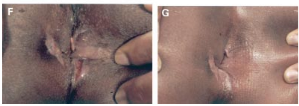
Figure 1 Clinical response to topical tacrolimus therapy in three children with oral or perianal disease. Case No 3 is shown in (A) and (B); case No 1 in (C–E); and case No 7 in (F) and (G). (A) Gross lip swelling with angular cheilitis which had not responded to steroids or nutritional exclusions in a five year old boy (case No 3). (B) Marked resolution of lip swelling after four weeks of topical tacrolimus therapy. He has subsequently shown a similar response to perianal disease. (C) Severe perianal ulceration in a girl with Crohn's disease (case No 1). The ulceration was deep, with a 2–3 cm cavity, which is not apparent on the photograph. (D) Marked healing of the lesion periphery in the same case after several months but with two areas of breakdown that occurred after a reduction in dosage (she had previously healed completely but had not been photographed). (E) Eventual complete healing which has been maintained on a programme of very slow reduction in tacrolimus concentration. (F) Marked perianal ulceration with open fistula track in a nine year old boy (case No 7). This had persisted despite successful treatment of his intra-abdominal disease. (G) Follow up appearances after four weeks of topical tacrolimus with marked improvement and healing of his fistula track.