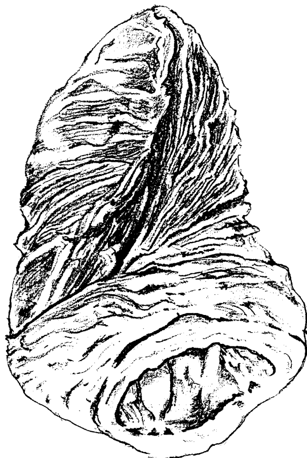
Figure 1 Diagram showing dissection in a normal left ventricular myocardium with the longitudinal fibres running between the apex and mitral ring and occupying the subendocardial and subepicardial layers.

In view of the preponderance of circumferential fibres, it seems logical to deduce underlying myocardial function from the extent and velocity of their shortening 3 ; however, the picture of the underlying function reached from observing changes in left ventricular minor axis is at first sight surprising. Normal dimensions fall by 25–40% during ejection, while the normally loaded sarcomere shortens by only 10–12%. 4 Furthermore, this remarkable fall in minor axis is the result of thickening of the posterior wall to an extent much greater than would be expected