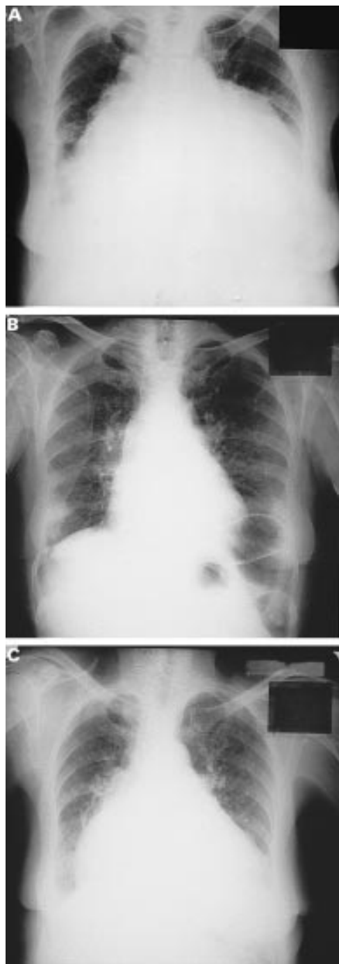
Figure 3. Sequential chest x rays from a patient with longstanding hypothyroidism that was complicated by congestive cardiac failure. (A) Before treatment. Cardiomegaly was caused by a combination of dilatation of all the cardiac chambers and pericardial effusion. (B) After treatment with thyroxine for nine months. (C) Seven years later, two years after the patient has stopped taking thyroxine, against medical advice, and had re-presented to the same physician with the symptoms and signs of heart failure. Reproduced from Davidson's principles and practice of medicine , 18th ed, p 570, with permission of the publisher Churchill Livingstone.

increase in mean basal heart rate, and atrial premature contractions. 12 Apart from an increase in left ventricular mass index within the normal range, these observations have not been verified. 13 Moreover, there is no evidence, despite the findings of the Framingham study,