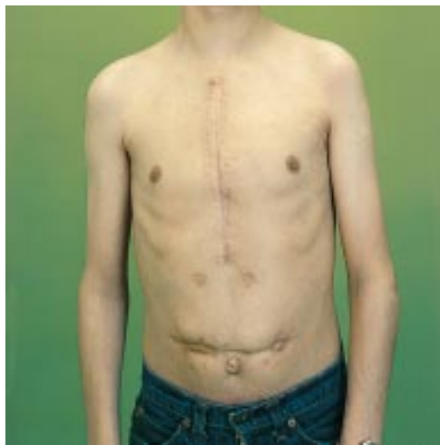
Figure 2. Constrictive pericarditis caused by infection presented 10 years after operation to relieve ileal atresia as a neonate. The patient had developed septicaemia as an infant but purulent pericarditis had not been recognised.

has been used to facilitate diagnostic pericardial biopsy. Triamcinolone can prevent recurrence of immunologically based effusions and cisplatin can deter re-accumulation of malignant effusions. 19