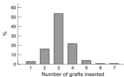
Figure 1 Breakdown (%) of the numbers of grafts inserted at coronary artery bypass grafting in the study patients.

ation. 19 The patients in the study were younger (mean age 58.2 v 60.7 years, p < 0.001 ) and were from areas of higher socioeconomic deprivation ( p < 0.001 ) compared with all patients in the health board area undergoing CABG during the same time period, but had a similar sex ratio. Comparisons with the UK CABG population of 21 568 patients undergoing CABG surgery during 1995/6 23 also confirm the similar sex ratio, but patients in the present series were younger (58.2 v 60.6 years, p < 0.001 ).