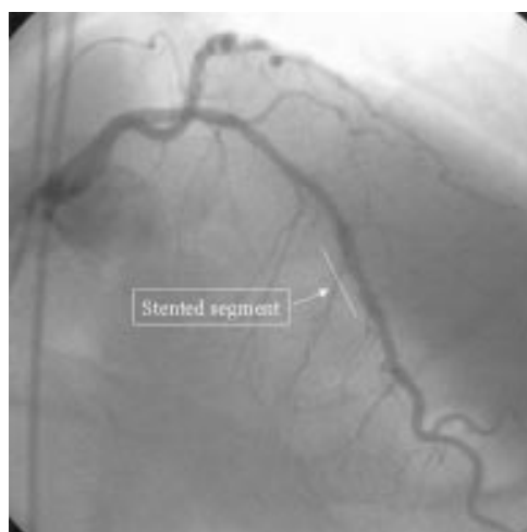
Figure 2 Six month angiographic follow up showing persistent optimal result in the stented segment (arrow) with no evidence of intimal hyperplasia.

Late total occlusion after coronary stent implantation is a progressive phenomenon that occurs in approximately 4% of patients when