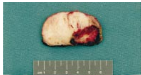
Figure 1 Prostate slice showing a high intensity focused ultrasound (HIFU) lesion. The HIFU lesion is characterised by a central yellow/white, necrotic zone surrounded by an outer dark red, haemorrhagic zone. The distance between two cross bars represents 0.5 cm.

After fixation and slicing of the specimens, circular to elliptical lesions were identified at the