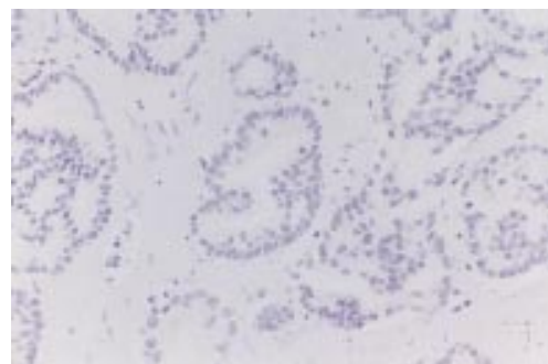
Figure 4 Absence of cyokeratin 8 expression in histomorphologically unaffected malignant epithelium within the high intensity focused ultrasound lesion. CAM5.2 antibody.

diaphragm in three cases. The proximal part of the seminal vesicles was affected unilaterally in three patients and bilaterally in two. In four patients, a 1–2 mm broad subcapsular rim of histologically unaffected prostate tissue was preserved at the dorsal side of the HIFU lesion, indicating incomplete tissue destruction. In all patients, unaffected tissue was also found at the ventral and lateral side of the HIFU lesions.