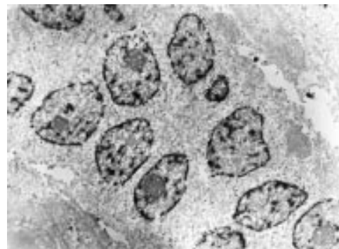
Figure 5 Electronmicrograph of an adenocarcinoma within the high intensity focused ultrasound lesion reveals destruction of cellular membranes and organelles but a relatively preserved nuclear structure. Magnification, \times 3000 .

Electron microscopy was performed to confirm submicroscopical cellular damage in two CK8 negative adenocarcinomas in the centre of the HIFU lesion that showed no apparent morphological cell necrosis by conventional light microscopy (fig 5). The carcinomas lacked nuclear membranes, but showed a fine chromatin pattern that was clumped at the periphery of the nuclei, and conspicuous nucleoli. The cytoplasm contained some vacuoles, but organelle structures and cell membranes were not identified. A CK8 positive adenocarcinoma