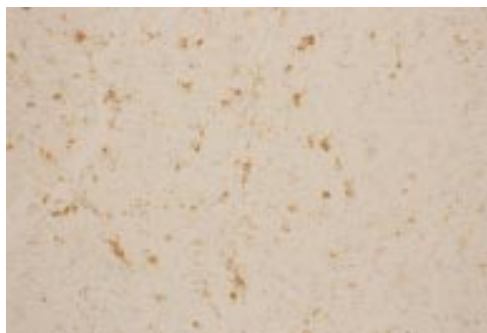
Figure 2 Infiltrating mononuclear cells in the myocardium are confirmed to be apoptotic by means of the TUNEL method using an ApoTag peroxidase kit (DAB-peroxidase; original magnification, \times 200 ).