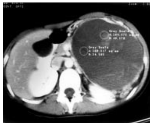
Figure 1 Axial computed tomography scan of the upper abdomen shows a circumscribed tumour in the transverse mesocolon, which displaces but does not infiltrate the surrounding organs.

In addition to routine and immunohistochemical staining, electron microscopy, flow cytometry, fluorescent in situ hybridisation (FISH) on tumour imprints, and comparative genomic hybridisation (GCH) were also performed to characterise the immunophenotype and ultrastructure, the ploidy, the p53 (17p13.1, biotin labelled; Oncor, Gaithersburg, USA), and the RB1 (13q14.2, biotin