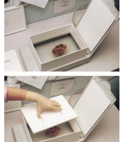
Figure 1 (A) The perspex box mounted on the scanner. (B) Application of the heavy sliding insert.

Because we had already been using a personal computer (PC) with scanning attachment for producing reports, some experiments were conducted using clear plastic bags to keep specimens immersed and to protect the scanner from contamination. From this the following system was developed.