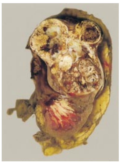
Figure 3 Kidney slice with large carcinoma in upper pole.

The images produced by scanning needed minimal manipulation as described previously. The images produced showed noticeable improvement over those taken with a standard point and shoot digital camera, this improvement being most noticeable with specimens prone to wet highlights, such as open bowels (fig 2A and B). It is possible to remove the highlights from camera images such as fig 2B with image manipulation techniques; however, this is extremely time consuming and degrades the accuracy of the image. This was unnecessary with the scanned image, thus preserving