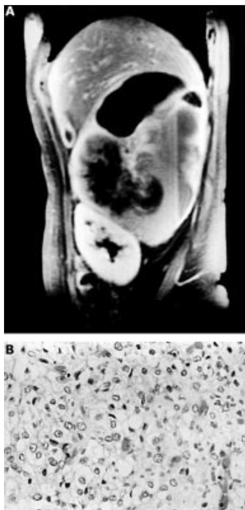
Figure 4 (A) Magnetic resonance imaging showing a cystic right adrenal liposarcoma (case 20). (B) Photomicrograph of the same adrenal liposarcoma showing the presence of lipoblasts. Haematoxylin and eosin stained; original magnification, \times 500 .

incidental findings by imaging and necropsy. Apart from myelolipoma, rare tumours such as lipoma, teratoma, angiomyolipoma, and liposarcoma were also found.