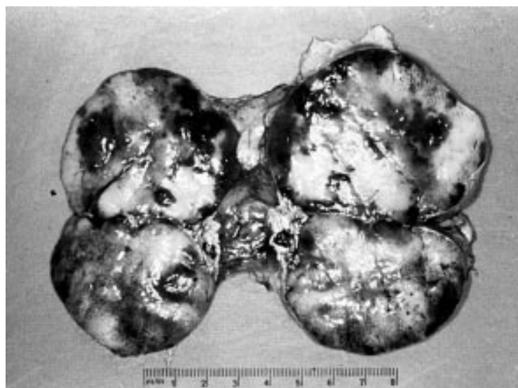
Figure 1 A dumb bell shaped myelolipoma (case 1).

Three patients (two women, one man) with teratomas were noted. They presented with non-specific back pain and adrenal masses