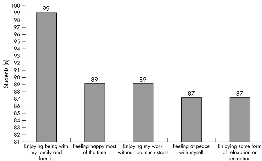
Figure 1 Top five aspects that are perceived to be important to being healthy.