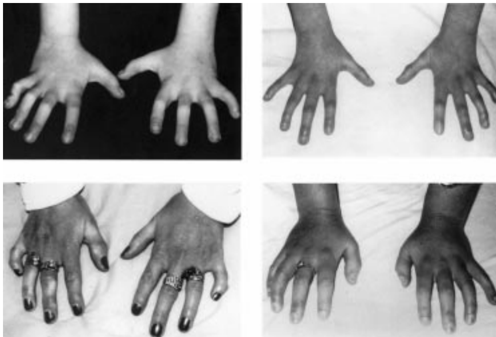
Figure 4 Camptodactyly and terminal interphalangeal contractures in subjects with SRS.

Seventeen patients (34%) were asymmetrical, with a limb length discrepancy greater than 0.5 cm. Limb circumference was also affected in all of these cases. All asymmetrical subjects had the classical facial appearance. The lower limb was involved in all cases. Ten also had upper limb asymmetry, and in these truncal and facial asymmetry was more often noticeable. The maximum leg length difference was 2.5 cm in a