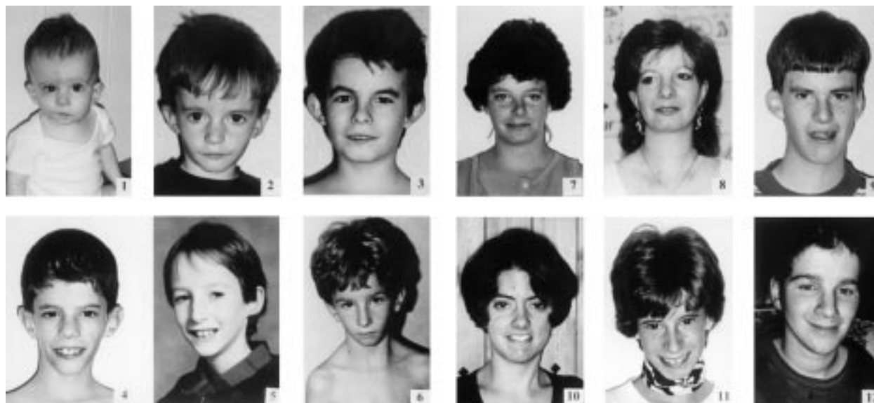
Figure 3 Twelve subjects with SRS from the "classical" group. Photographs 1-12 are cases 12, 1, 7, 5, 17, 20, 16, 9, 10, 28, 31, and 8 respectively from table 1. (All photographs reproduced with permission.)

Table 1 shows some of the clinical findings. Measurements are those recorded at the time of the study. The centile for head circumference was above that for height in 35 cases, but there were children without sparing of head growth, most notably case 3. This child had striking SRS facial dysmorphism. There was no