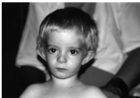
Figure 1 Typical features of a child with the SRS phenotype.

tardation in mice. 17 Uniparental disomy of chromosome 7 was suggested by three cases with unexpectedly severe short stature in association with diseases at this chromosome location. Two had cystic fibrosis caused by homozygosity of a maternal cystic fibrosis mutation, and a third child was homozygous