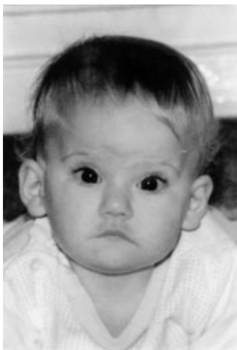
Figure 2 The face of a infant with Smith-Magenis syndrome. (All photographs reproduced with permission.)

obtained on each subject (table 1) following the method published by Farkas. 8 Measurements were taken by one of the authors (JEA). They were recorded to the nearest 0.5 mm using GPM sliding and spreading, blunt ended calipers and a paper metric tape measure. These dimensions were chosen to represent craniofacial widths, lengths, depths, and circumferences plus details of ear, eye, nose, and mouth structure (fig 1). For each dimension, age and sex matched normal standards were available. The population norms were derived from measurements of the head and face in 2326 healthy North American white children and young adults. 9 The raw data were compared to normal standards and converted to Z (standard deviation) scores to control for age and sex differences. Thus, a score of +1 would indicate a dimension one standard deviation