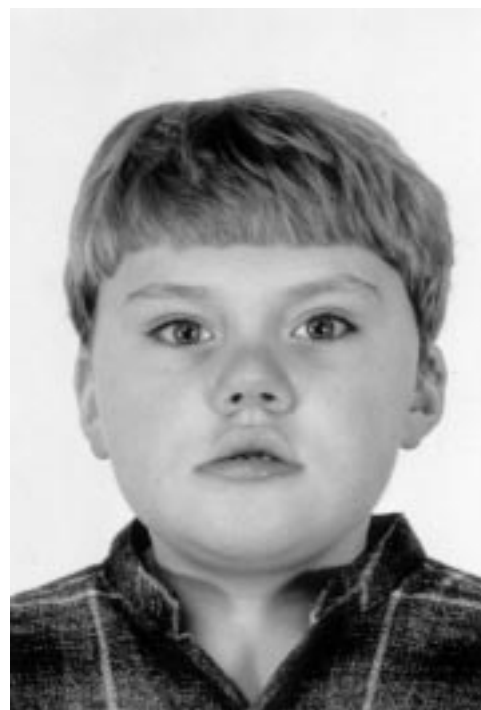
Figure 3 The face in mid-childhood.

above the mean. Pattern profiles were compiled for each age and sex. Because of small numbers at certain ages, additional profiles were produced for groups of subjects: ages 3 to 8, 8 to 12, 12 to 16, and 16 and over. Correlation coefficients and variability indices were generated by the Statistical Package for Social Scientists (SPSS), using the methods published by Garn et al. 10 11