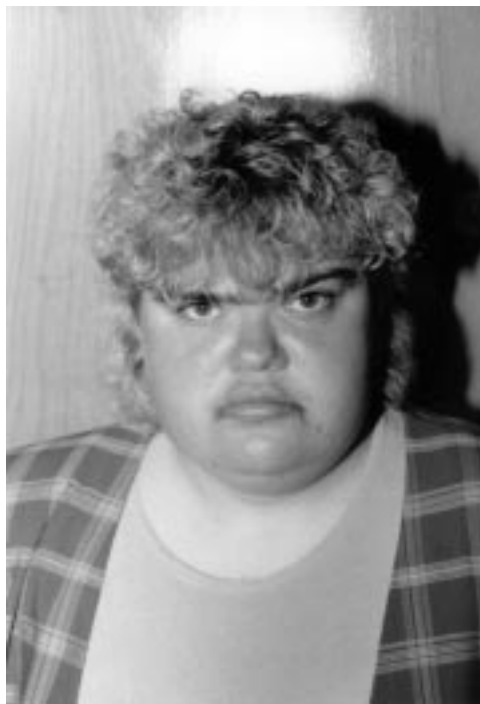
Figure 4 An adult with Smith-Magenis syndrome.

are seen. There is considerable similarity between patterns. Table 2 documents the correlation between age groups. The closest correlation is between groups 1 and 2, and 2 and 3 ( p < 0.001 ). Group 4 is less closely correlated with other groups ( p < 0.01 ). When the degree of dysmorphogenesis (that is the variation from the mean) is evaluated, the