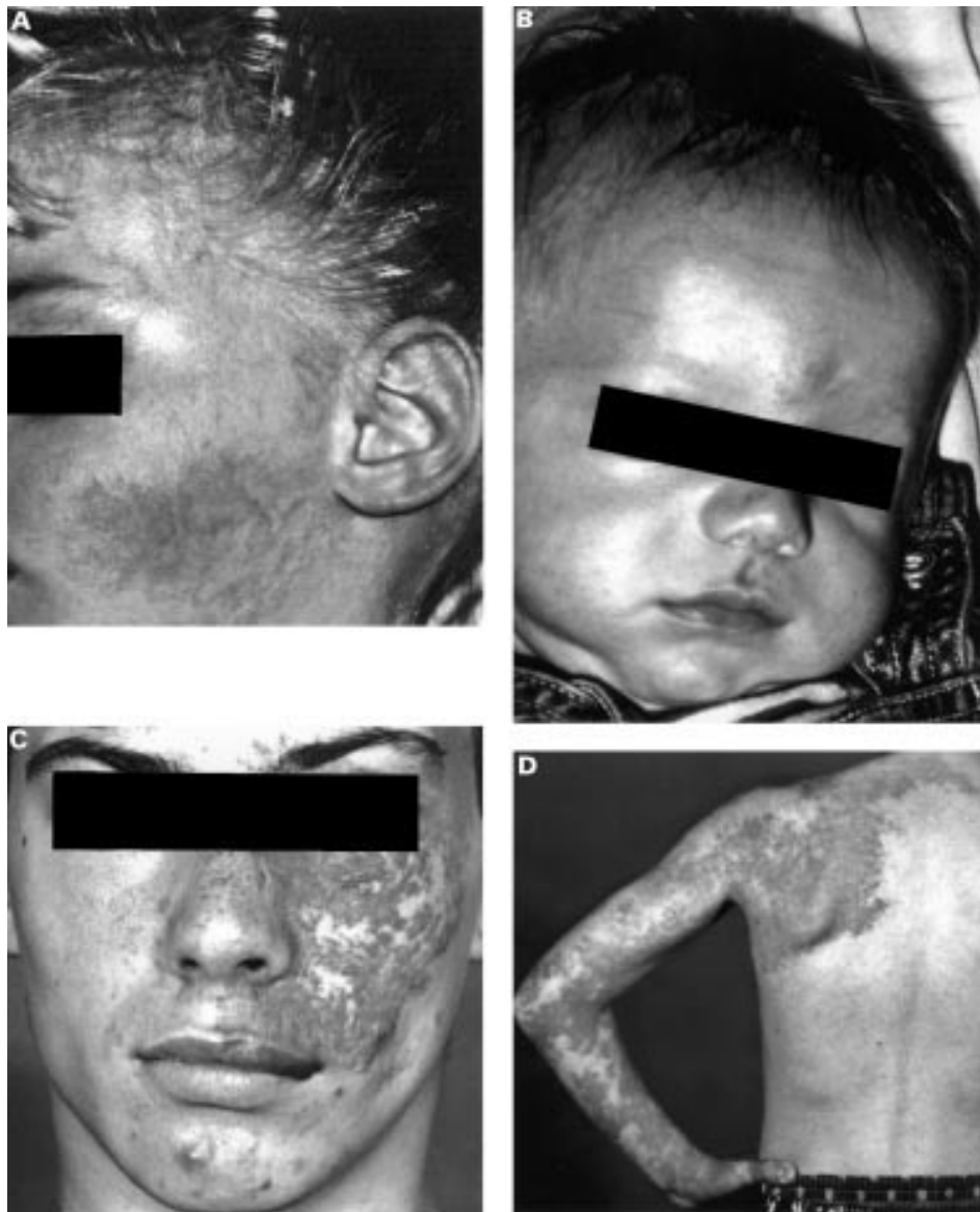
Figure 2 (A) III.1: left facial port wine stain following laser treatment. (B) III.2 with faint port wine stain affecting nose and upper lip. (C) III.3: port wine stain affecting left side of face. (D) III.4: port wine stain affecting upper left quadrant of body.

An alternative explanation would be that the reduced gene product in endothelial cells renders the capillary plexus more susceptible to the environmental influences which may cause sporadic PWS.