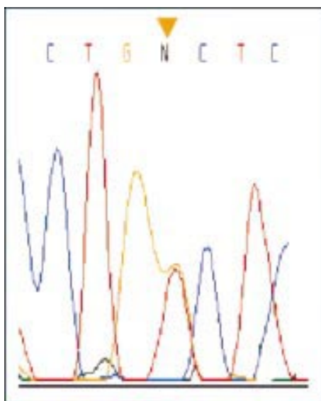
Figure 2 DNA sequencing electropherogram of the promoter region of the human SPINK1 gene showing a heterozygous G to T change at nt 215 upstream from the translation initiation site (-215G>T) in a patient with tropical calcific pancreatitis. The mutation was absent in 200 alleles from normal subjects. The arrowhead indicates the altered nucleotide.