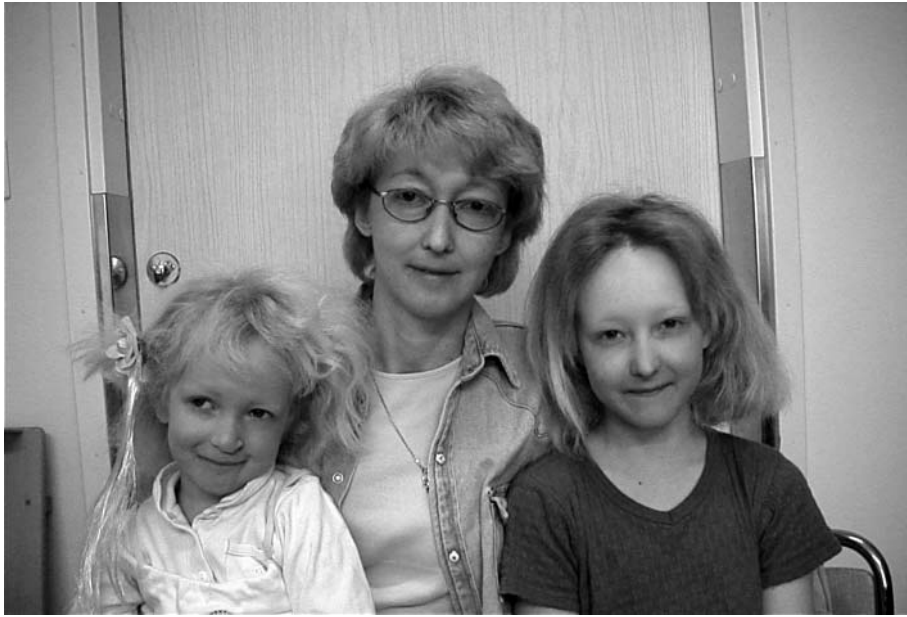
Figure 2 Facial appearance of RHS patients from Family A. The mother is wearing a wig.

cleft palate and the younger daughter had a cleft lip and palate. The mother lost her hair after recurrent scalp infections. Both she and her elder daughter had many pigmented naevi. The patients had normal nipples and the mother breastfed her children. The cleft and absence of hand and nipple anomalies excluded LMS in all patients. The absence of ankyloblepharon filiforme excluded AEC, and the patients were diagnosed as affected by RHS. However, a thorough study of the patients' clinical histories ascertained that the mother had a slight ankyloblepharon on the right eye at birth, which was surgically treated. According to Gorlin's criteria, she was affected by AEC.