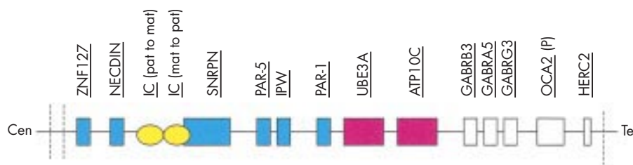
Figure 4 The Angelman/Prader-Willi region on chromosome 15q11-13 which spans 4 Mb. The common breakpoints are represented by dashed lines. Paternally imprinted genes are depicted in blue and maternally imprinted genes in pink. Those depicted in white are not known to be imprinted. The imprinting centre (IC) is bipartite. The centromeric portion is responsible for the paternal to maternal imprint switch and deletions in this part cause AS. For further details see text.