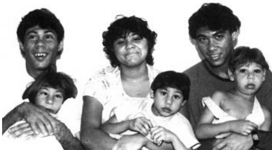
Figure 1 Six of the eight affected subjects with ages between 4 and 27 years with a diagnosis of autosomal recessive primary microcephaly.

Linkage to the five known MCPH loci was ruled out (data not shown). An autosomal chromosome screen for regions of shared homozygosity was performed on seven of the eight