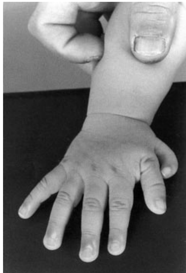
Figure 3 Hand of proband.

On examination II.8 had significant macrocephaly with a head circumference of 66 cm (>98th centile), a height of 169 cm (10th centile), and a weight of 73 kg (60th centile) (fig 2).