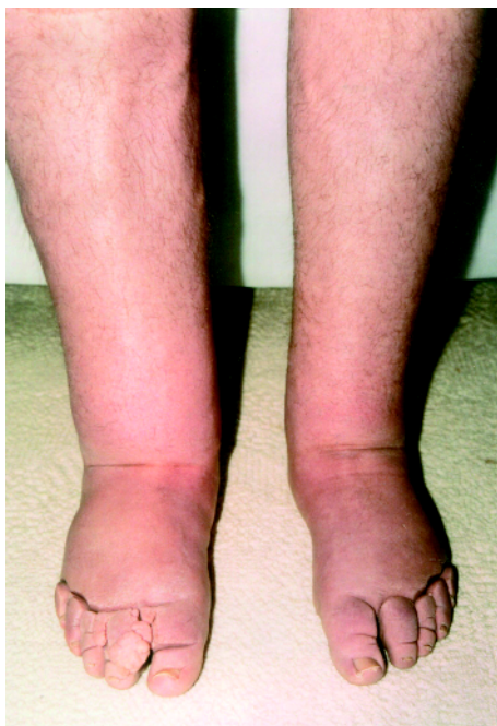
Figure 1 Evidence of lymphoedema in a 45 year old man. This individual from PCL-900 3 has had bilateral swelling of the lower limbs since birth, with papillomatosis and nail changes.

lomatosis, hydroceles, and prominent veins in the lower legs (fig 1).