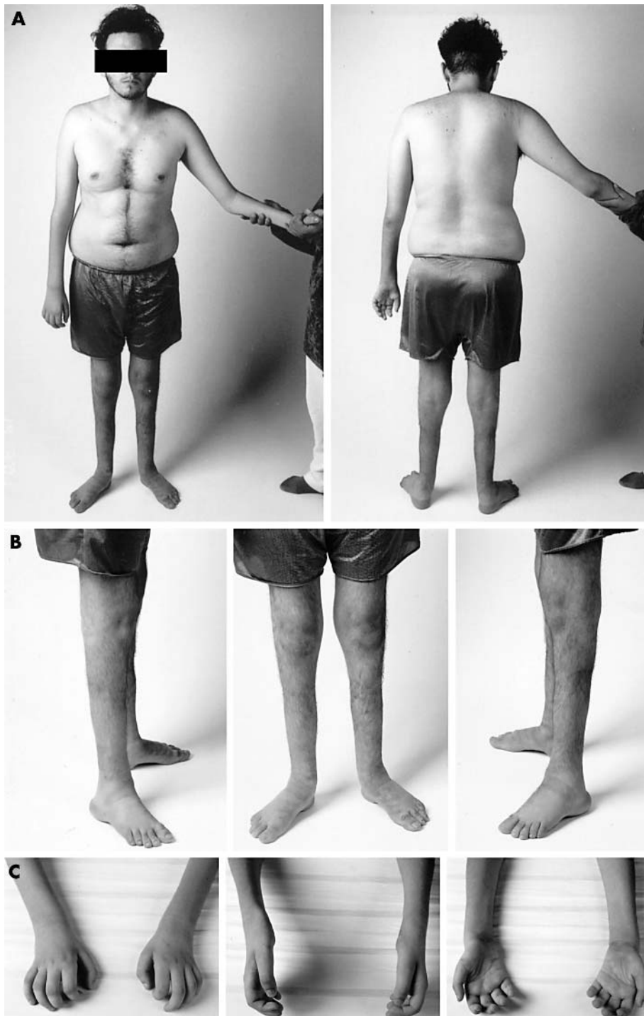
Figure 3 Proband IV-36. (A) Dorsal and frontal view; (B) distal atrophy of lower limbs; (C) muscle atrophy and hand deformities.

DSMA presenting with the phenotype of peroneal muscular atrophy should be distinguished from the demyelinating and axonal types of CMT disease (CMT1 and CMT2, respectively). Although in DSMA there is no involvement of the sensory fibres, clinical differential diagnosis between CMT1 and CMT2 may be impossible, as about 60% of CMT patients (particularly CMT2) have no clinical sensory loss. 2 DSMA may be distinguished from CMT1 and CMT2 by the presence of normal sensory conduction velocities and action potentials, and normal findings on sural nerve biopsy. 3, 21