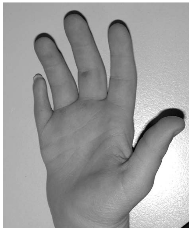
Figure 2 The right hand of case 4 showing a short, inflexible fifth digit with a ram's horn shaped nail and hypotrophy of the hypothenar muscles.

Patients with an interstitial 4q deletion have been described with a range of features, depending on the proximal and distal breakpoints of the deletion. 19 As it is known that fifth finger anomalies and short stature are found in patients with an interstitial deletion of 4q including 4q34, 20 as well as in patients with a terminal deletion of 4q, it is possible that the genes responsible for these features are located within this region.