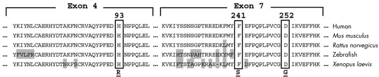
Figure 2 Multiple alignment of PTEN and homologous genes in other organisms (that is, Mus musculus , Rattus norvegicus , zebrafish, and Xenopus laevis ) showing the extent of sequence conservation in exons 4 and 7. The three residues (H93, F241, and D252) implicated in our patients are conserved among other gene families (shown in boxes). Amino acids that are not conserved are shaded in grey. Amino acid substitutions are shown below the alignment.

PTEN gene may be in this region. A positive yield for PTEN gene mutations should be anticipated particularly in autistic subjects with extreme macrocephaly with or without features of BRRS or CS. Finally, presentation of an autism spectrum disorder in an individual should now be considered as another indication for PTEN gene mutation screening particularly in those with extreme macrocephaly (that is, HC greater than +4 SD) as observed in our study.