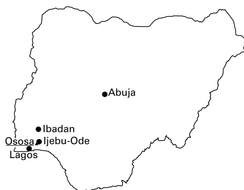
Figure 1 Map of Nigeria showing Ososa in relation to some major towns.

and konzo, which is also attributed to exposure to dietary cyanide. 22