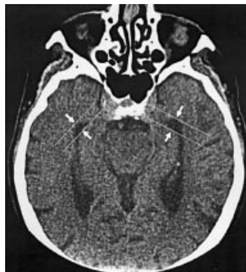
Figure 1 Example of measurement of the radial width of the temporal horn. The slice is chosen where the temporal horn is most evident. Different slices can be used for the right and left measurements, although a case is shown where the same slice was chosen for both sides. The dotted lines represent the tangents to the tip of the horn at its largest point. Arrows indicate the measured widths of the temporal horns.

The measure of temporal atrophy (radial width of the temporal horn (rWTH) was originally devised as an easy to perform tool that might help in distinguishing patients with early Alzheimer's disease from normal older people and was centred in the anterior part of the temporal horn, anteriorly to the midbrain in the area of the hippocampal head (fig 1). It is defined as the maximum distance between two parallel lines tangent to the borders of the tip of the temporal horn (fig 1). These lines usually form an angle of 30° to 60° with the midsagittal line. Test-retest and interrater reliability were assessed separately for the right and left rWTH measures on CT films of 20 randomly selected patients with Alzheimer's disease (age 76 (SD 8) years; 75% women; MMSE 21 (SD 3)) by two of us (CG and GBF). Intraclass correlation coefficients (ICCs) were computed showing satisfactory test-retest (ICCs of 0.98 and 0.99) and interrater (ICCs of 0.95 and