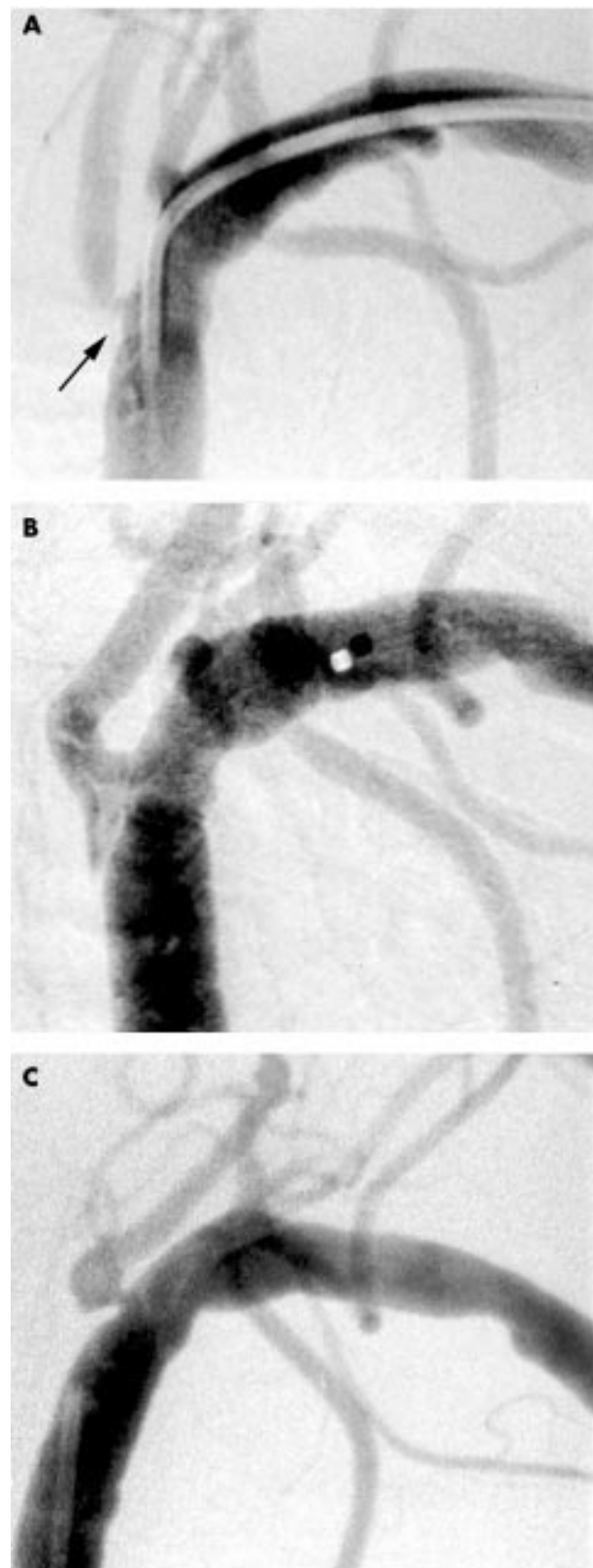
Figure 1 Digital subtraction angiograms in a patient showing (A) severe vertebral artery origin stenosis before treatment, (B) successful vessel dilatation immediately after balloon angioplasty, and (C) severe restenosis at follow up angiography one year later.

Ten patients (Nos 5–14) were treated by primary stenting and have been followed up for a mean of 19.7 months (range 1 to 48). All stenoses were treated successfully, with a mean improvement in angiographic stenosis severity from 82 (8)% before treatment to 13 (13)% after treatment ( p < 0.001 ; paired t test). One patient experienced two posterior circulation TIAs, each lasting less than five minutes, 72 hours after stenting. Thus the risk of TIA after stenting in this series was 20%. There were no other immediate or early complications. Follow up colour Doppler ultrasound examination showed evidence of restenosis in only one case, six months after the procedure, which was found to be a 55% stenosis on catheter angiography. The patient remained asymptomatic and subsequent colour Doppler ultrasound examinations, including the latest scan done three years after stenting, have shown normal velocities. None of the stented patients has reported posterior circulation stroke symptoms during the prospective follow up. Two patients had right middle cerebral