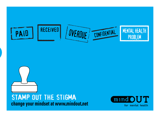
Figure 3 Poster for the UK MindOut campaign, sponsored by the Department of Health.