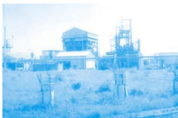
Figure 1 The Union Carbide factory in Bhopal, source of the world's worst chemical incident.

Persons who are at risk following a chemical incident comprise all those who suffered sufficient exposure to the released agent(s) to induce illness. In general they extend far beyond the population who seek local medical care following the incident, and their enumeration requires access to demographic data across the area of contamination. Identifying the complete at-risk population allows a valid estimate of the (potential) scale of the incident and of its expected effects, but is also essential for the design of subsequent epidemiological studies. Three factors should be considered before embarking on this difficult process; often only crude data are available in