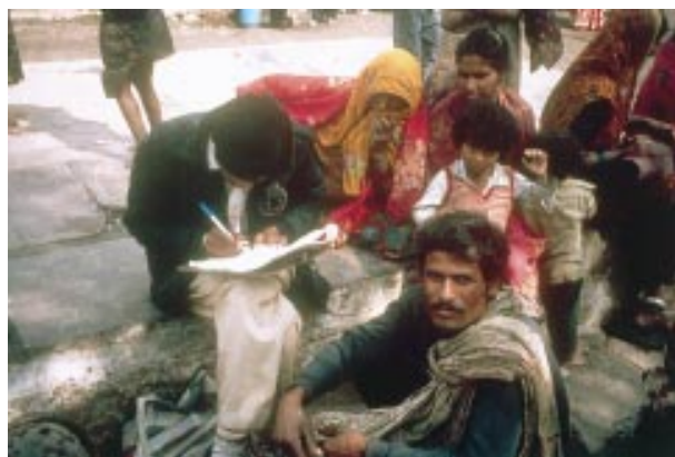
Figure 3 Conducting a cross sectional survey following the Union Carbide gas leak in Bhopal.