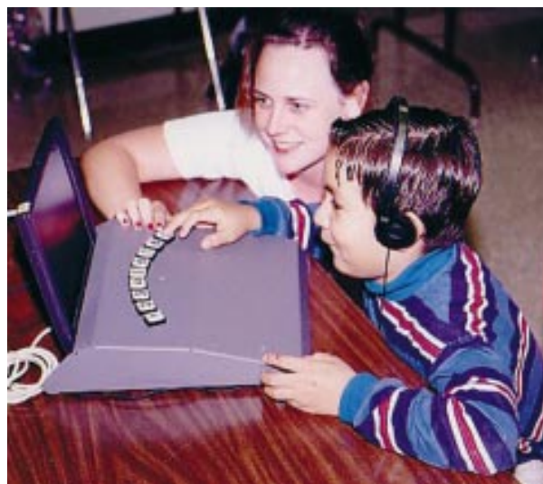
Figure 2 Picture of child working on a behavioral assessment and research system (BARS) test.

At the same time ATSDR developed the AENTB, that agency convened an expert group to suggest a parallel series of tests for children. The group recommended a strategy rather than a specific battery. 43 ATSDR implemented the strategy following