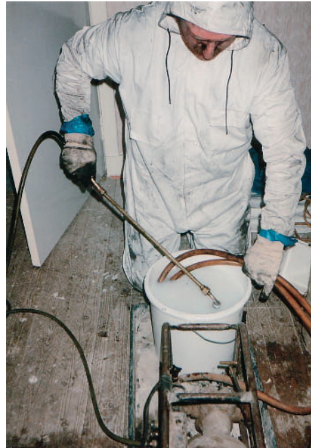
Figure 2 Worker in coverall washing spray lance.

There is growing interest in the dermal uptake of organic solvents. Solvents are used as thinners, degreasants, de-icers, and paint coatings. In Britain an estimated two million workers have regular contact with solvents, and approximately one in three workers report having worked in a job where they were exposed to these chemicals at some stage in their working lives. Several hundred million tonnes of solvents are used worldwide per year; the vast majority of use involves ethanol, isopropanol, acetone, toluene, xylene, or mixtures of these. Organic solvents used more commonly in the past include benzene and carbon tetrachloride. Despite their widespread use, solvents are known to be toxic to a number of target organs within the body including the kidneys, liver, and nervous system. In terms of neurotoxicity, high exposures are known to cause acute symptoms including dizziness and nausea. They may produce long term irreversible damage to the central nervous system causing behavioural and personality changes. As solvents tend to be volatile, measurement of exposure has primarily focused on inhalation of vapour. However, the highly lipophilic nature of