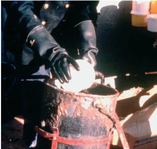
Figure 1 Worker using solvents to clean sludge from barrel.

biological dose received during sheep dipping comes via the dermal route with the primary determinant of exposure being the handling or mixing of sheep dip concentrate rather than the amount of contact with diluted sheep-dip. 4