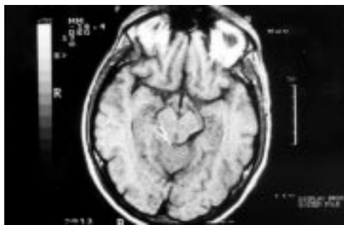
Figure 1 Contrast-enhanced T-1 weighted MRI at presentation

One month later the fever re-appeared, the CD4 count was 42 \times 10^6/l , and the HIV viral load was 2525 000 copies/ml. The patient also suffered from headaches and appeared lethargic. On physical examination he showed marked stiffness of the neck and left hemiparesis. Contrast-enhanced T-1 weighted MRI (figure 2) displayed a large mass with a hypo-intense centre in the perimesencephalic region.