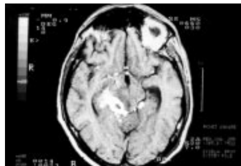
Figure 2 Contrast-enhanced T-1 weighted MRI one month later

Department of Internal Medicine, Hospital Rio Hortega, University of Valladolid, Valladolid, Spain