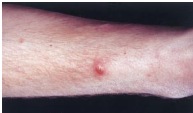
Figure 3 Acneiform skin lesion.