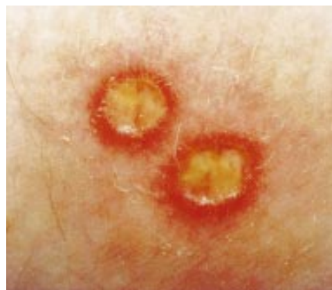
Figure 4 Pustular skin lesions remarkably resembling aphthous ulcers.