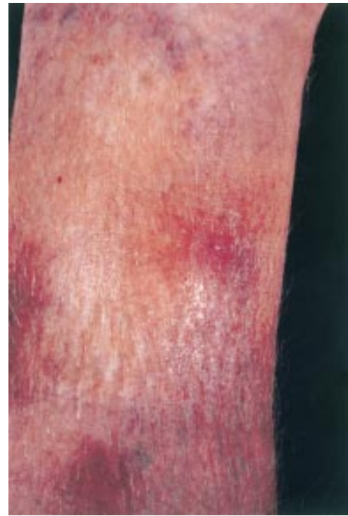
Figure 7 Superficial thrombophlebitis in the lower leg.