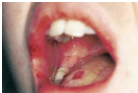
Figure 1 Aphthous ulcers involving the lip and tongue.

There are sporadic reports of patients with symptoms both of Behçet's disease and relapsing polychondritis, the so-called MAGIC syndrome . 78