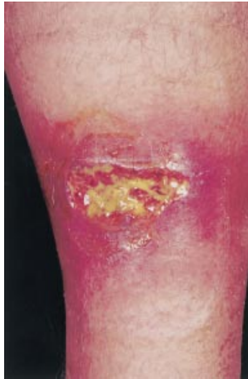
Figure 6 Typical pyoderma gangrenosum lesion in a young male patient with severe disease.