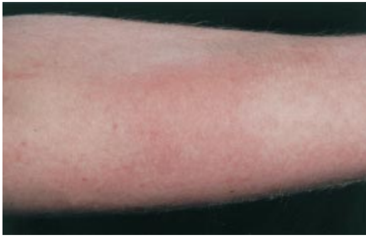
Figure 5 Erythema nodosum.