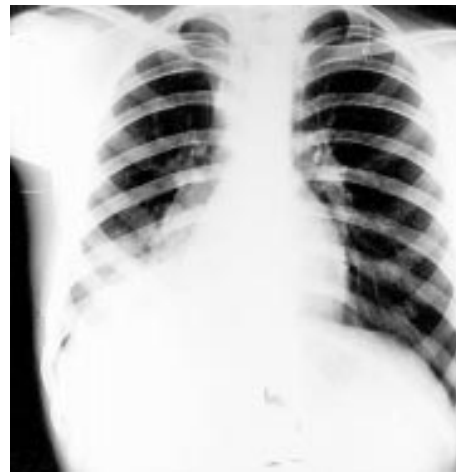
Figure 1 Chest radiograph showing right hilar enlargement, volume reduction of the right hemithorax, and non-homogeneous opacity on the right heart border.

foreign body passes through the vocal cords into the subglottic or tracheal region, inspiratory stridor with bouts of coughing may be noted. However, further travelling of the foreign bodies into the bronchi leads to a resolution of these symptoms, and a relatively asymptomatic period may begin. Cough, wheezing, and decreased breath sounds are the most common acute symptoms of FBA, and such new symptoms, especially in children, should always suggest the possibility of a foreign body. 12 It has been reported that about 50% of patients with FBA do not have a contributing history, and 20% of all children are given medication for other disorders for longer than a month before diagnosis. 13-15 In the presence of long standing aspirated foreign bodies, recurrent haemoptysis, and symptoms consistent with recurrent bronchitis, pneu-