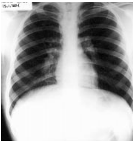
Figure 3 Control chest radiograph showing complete resolution of the previous middle lobe atelectasis, and also right hilar enlargement.