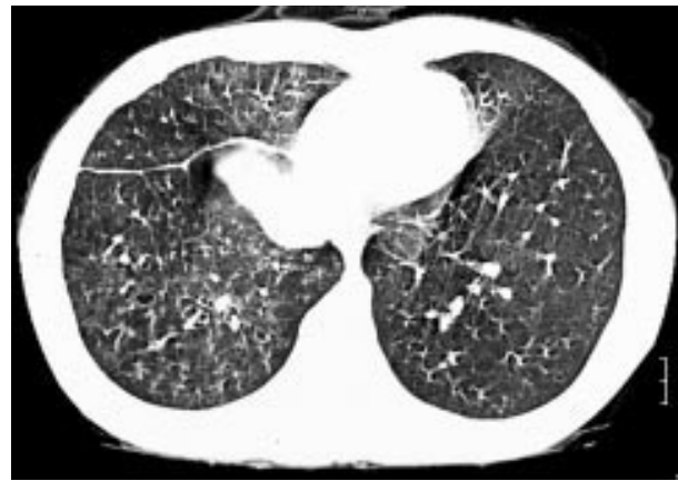
Figure 4 Control computed tomogram of the thorax demonstrating the complete resolution of the previous middle lobe atelectasis and pneumonic consolidation, as well as significant resolution of the bronchiectatic dilatations in the right lung.