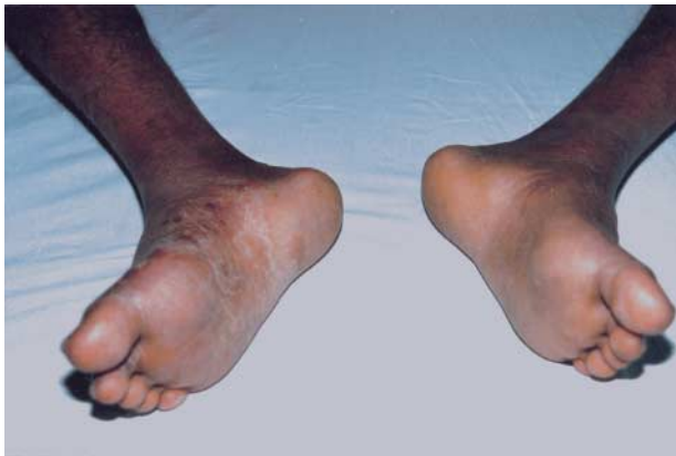
Figure 2 Keratosis of soles on day 13th of illness.