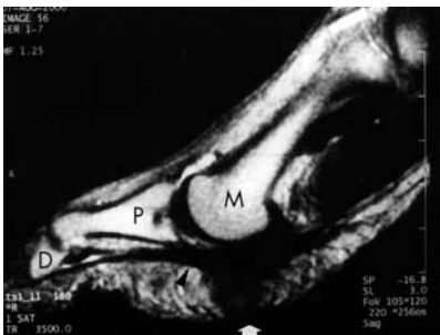
Figure 2 MRI, T2-weighted image; D, distal phalanx; M, metatarsal bone; P, proximal phalanx.

A 56 year old woman presented with a hard subcutaneous mass in the plantar aspect of the right foot. This isolated mass demonstrated slow growth over four months, but there was no local pain or fever. On magnetic resonance imaging (MRI), the tumour was demonstrated as a subcutaneous mass with low signal intensity both on T1 and T2-weighted images (figs 1 and 2, arrows), indicating fibrous matrix. The mass showed marked enhancement on enhanced T1-weighted image (fig 3, arrow), contained a cystic change (not shown), and broadly adjoined the flexor hallucis longus tendon (arrowheads). At surgery, a white hard mass with a cavity was found to arise from the plantar aponeurosis. Histological examination revealed a benign reactive proliferation of dense collagenous matrix with markedly enlarged vessels. There has not been any recurrence for 18 months after surgery.