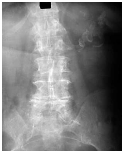
Figure 1 Abdominal radiograph of patient.

An 80 year old frail, demented woman was referred to hospital for being generally unwell and with vague lower abdominal discomfort. As a matter of routine, an abdominal film was also taken (fig 1). Interestingly, though the left upper abdomen was not the site of any pain or discomfort, there was a significant finding. There was a circular calcification in the left upper quadrant, along the course of the splenic artery, which is strongly in favour of a splenic artery calcification. This finding is also quite typical of a splenic artery aneurysm 1 ; this is not just a radiographic diagnosis alone, but requires confirmation with other modalities like Doppler ultrasound and computed tomography. 2 In this case further aggressive investigations were not done considering her co-morbid conditions.