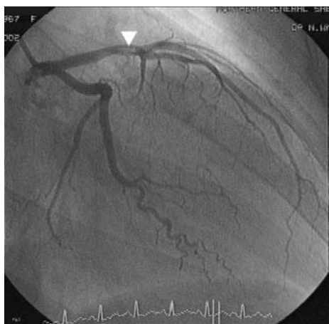
Figure 2 Coronary angiogram showing LAD dissection extending over a marginal artery (white block arrowhead).

Crohn's disease is a well recognised prothrombotic state causing venous and arterial thromboses. 8 Histological evidence in Crohn's disease and coronary artery dissection support inflammatory cell infiltration in the affected cell walls. It remains debatable if it is the cause or effect in the latter. 8-9 We postulate that active Crohn's disease may predispose patients to spontaneous coronary artery dissection by the release of proinflammatory cytokines causing intramedial haemorrhage and thrombosis due to rupture of vasa vasorum. 10 The luminal pressure exerted by the shearing effect of this intramedial damage, in a normal coronary artery, can lead to dissection due to the absence of the stenting effect of an atheroma. Continued smoking probably contributed to the