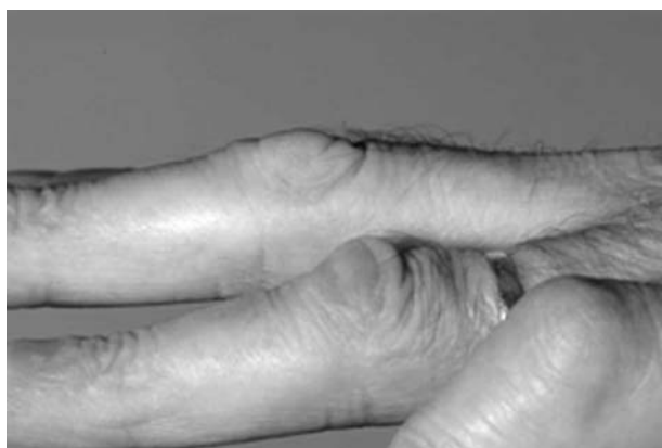
Figure 3 Knuckle pads. They may also occur along with plantar nodules as part of a Dupuytren's diathesis, where DD develops at a young age and to a severe degree, in those with a strong family history.

There is no relation between diabetic control and the severity of contractures, and DD has a generally milder form in diabetic patients. This suggests that diabetes may only be a triggering factor. It may be that microvascular changes in DM encourage local hypoxia, and this could elicit DD in those