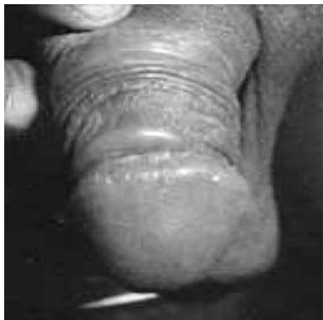
Figure 1 Mondor's disease of penis presenting as a firm, cord-like lesion of the coronal sulcus

Penile Mondor's disease is a benign pathology of the superficial dorsal penile vein affecting sexually active men. 2 In this study most of the subjects were young and under 45 years of age. Although lesions are classically asymptomatic, some patients have pain or discomfort, especially on erection. 5,6 The majority of our patients were asymptomatic and only one third presented with mild to moderate pain and tenderness