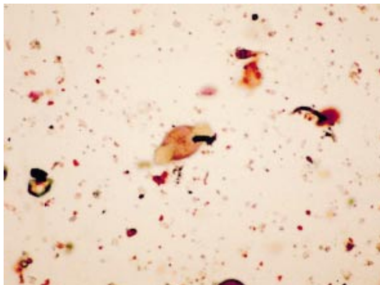
Figure 3 Photomicrograph showing rye grass pollen grains. The grain in the centre is in the process of rupturing and releasing its starch granule contents.

For the analysis presented here the segment of the exposed tape corresponding to 30 October was isolated, embedded in silicone grease,