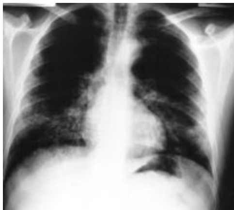
Figure 1 Chest radiograph at presentation showing bilateral pulmonary infiltrates.

Received 25 September 2000 Returned to authors 22 January 2001 Revised version received 15 March 2001 Accepted for publication 23 April 2001