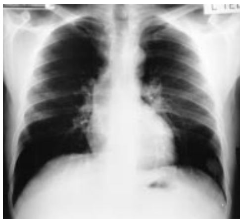
Figure 3 Chest radiograph following 3 months of treatment with GM-CSF showing complete resolution of the pulmonary infiltrates.

in May 1999. This was well tolerated with only minor pain experienced at the injection site. His leucocyte count rose to a peak of 29.4 \times 10^9/l (eosinophils 39%, neutrophils 52%) which improved following suspension of the treatment for 7 days. After 3 months of daily treatment with GM-CSF he was asymptomatic with normal spirometric values and arterial oxygenation, and resolution of the changes on the chest radiograph (fig 3), and has remained well with normal ventilatory function and a clear chest radiograph to date.