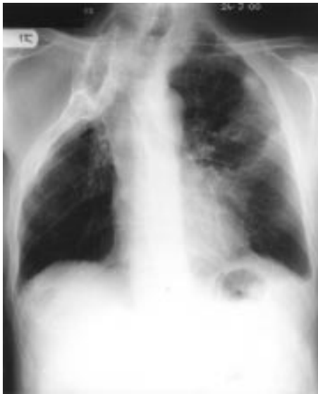
Figure 1 Chest radiograph of the father taken on admission showing right thoracoplasty and new lingula consolidation.