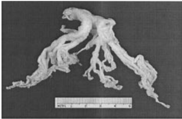
Figure 1 Mucus cast of bronchial tree coughed up by an asthmatic patient during an exacerbation. Reproduced with permission of E Klatt, Utah.