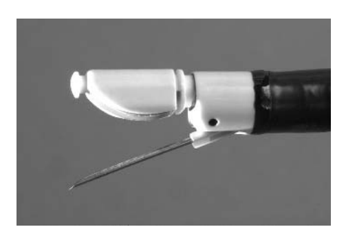
Figure 1 Distal end of the prototype fibreoptic ultrasonic bronchoscope (Olympus XBF-UC40P) with an electronic linear array ultrasonic transducer and a needle introduced via the biopsy channel.

can be filled with water can be mounted around the transducer for better ultrasonic coupling with the bronchial wall.